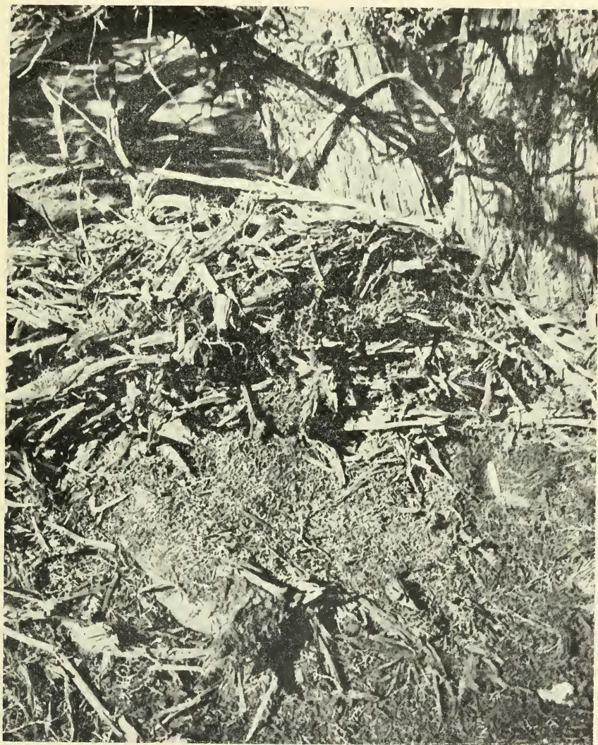
Fig. 3. Cutaway of woodrat house showing the position of nest (scalpel) and burrows.